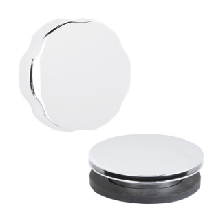
Quick turn accessible drain releases drain without bending.