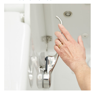
Ergomic door handle is uniquely designed for simple opening and closing of door.