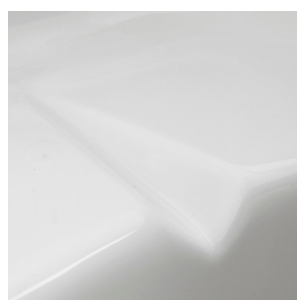
Hygienic seat channel allows you to easily wash hard to reach areas without lifting your body.