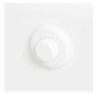
Raised air switch button for simple on/off operation of whirlpool.